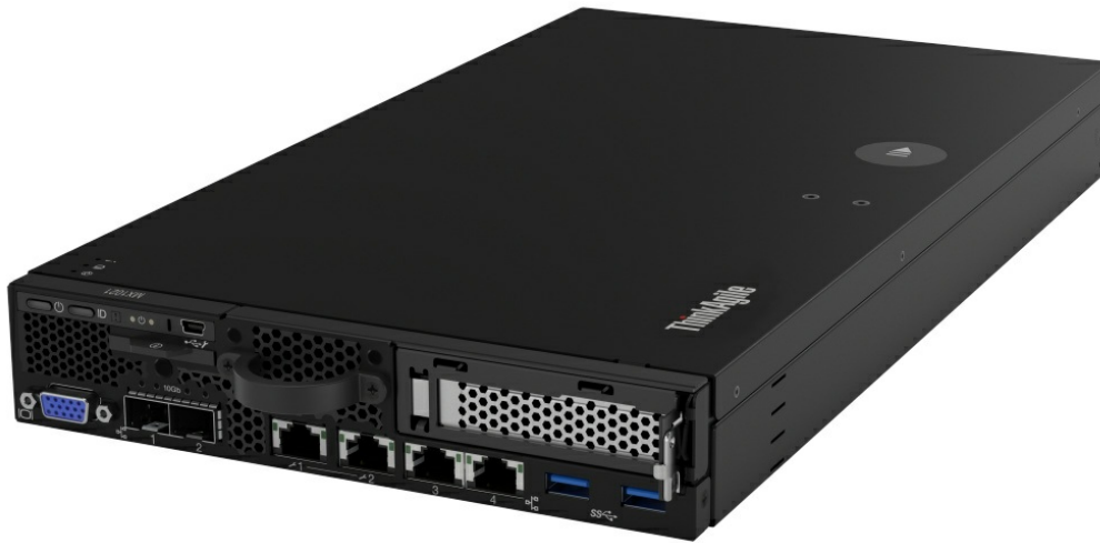
Figure 2. ThinkAgile MX1021 Certified Node

The new ThinkAgile MX1021 offering from Lenovo combines these features with the Azure Stack HCI capabilities of Windows Server 2019 Datacenter Edition to provide the perfect combination of hybrid computing for the edge.